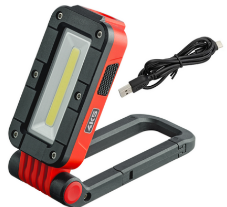
WL 380, USB-C-cable