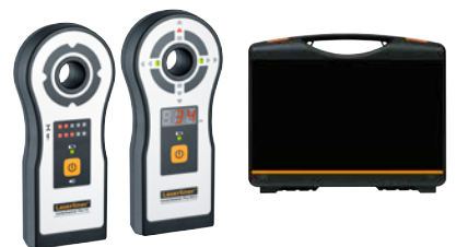
Integrated LCD display