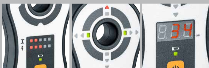
Clearly visible LED indicators